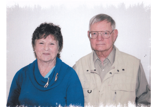
Please Pick The Days When You Can Pray For Us ↔ We Are Grateful for Your Prayers